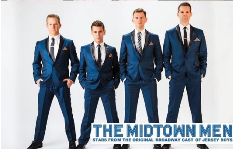
THE MIDTOWN MEN STARS FROM THE ORIGINAL BROADWAY CAST OF JERSEY BOYS